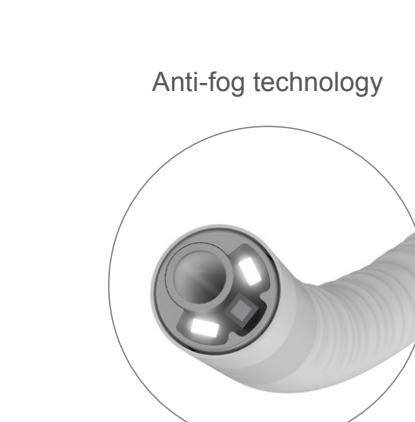
Working channel remains fully patent, for suction efficiency