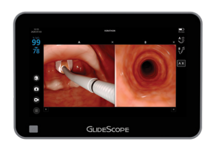
GlideScope® Core™ 15